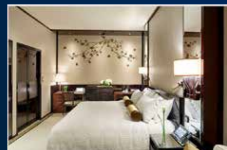
Deluxe Harbour View Suite

Last date to book CMF Special Discount Rates : May 16, 2025