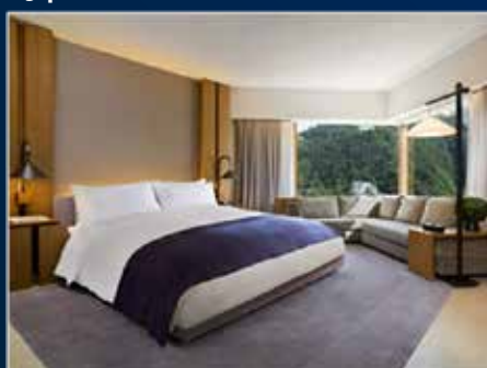
Studio 70 Island View