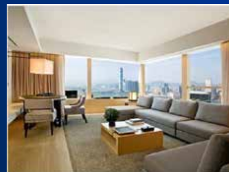
Upper Suite Harbour View

Last date to book CMF Special Discount Rates : May 6, 2025