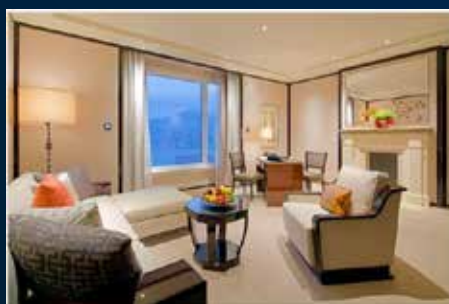
Grand Deluxe Harbour View Room