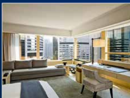
Studio 80 Island View