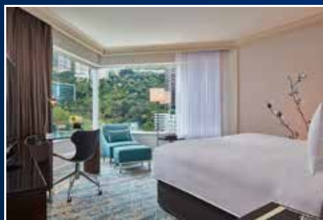
Deluxe Room King Bed

Last date to book CMF Special Discount Rates : May 13, 2025