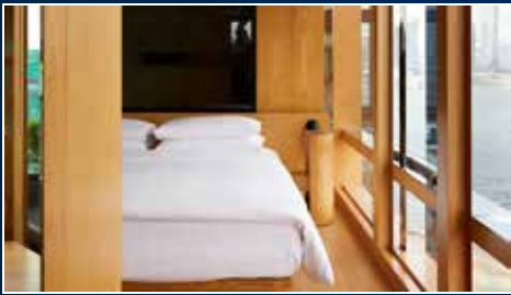
King Bed Harbour View