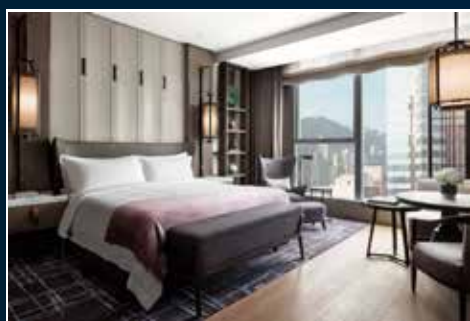
Deluxe Room City View