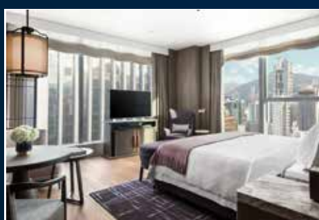
St Regis Suite City View Corner Room

Last date to book CMF Special Discount Rates : May 12, 2025