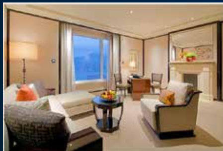
Grand Deluxe Harbour View Room