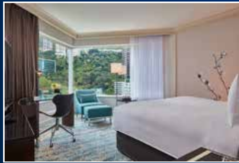
Deluxe Room King Bed

Last date to book CMF Special Discount Rates : May 13, 2025