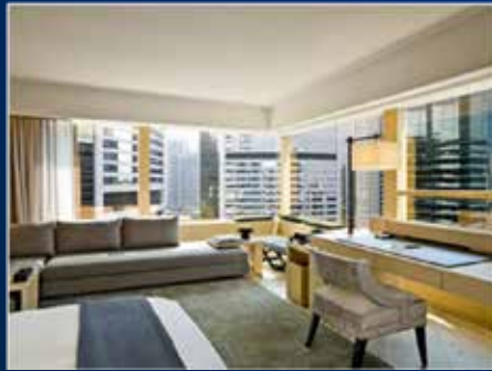
Studio 80 Island View