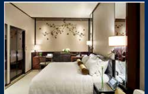
Deluxe Harbour View Suite

Last date to book CMF Special Discount Rates : May 22, 2025