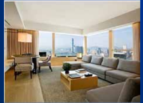
Upper Suite Harbour View

Last date to book CMF Special Discount Rates : May 6, 2025