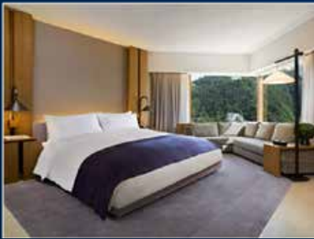
Studio 70 Island View